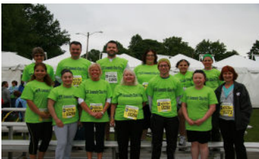
TEAM N.E.W. COMMUNITY CLINIC

13 employees from the clinic participated in this year's Bellin Run / Walk. This was a great way for all to promote a healthy lifestyle and spend time together outside the clinic.